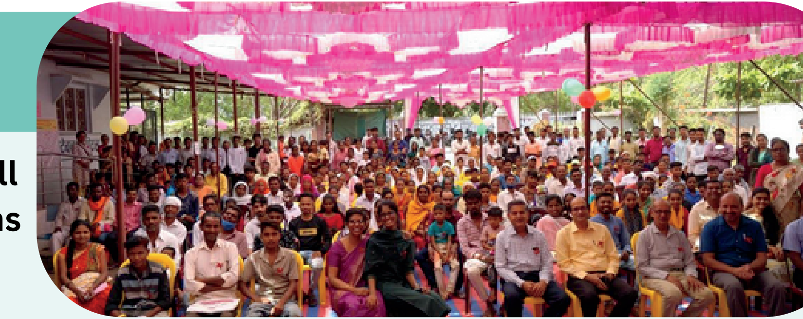
World Sickle Cell Day Celebrations

Nandurbar , a culturally rich tribal district in Maharashtra, has 69% tribal population, low literacy (64.4%), and nearly 72% living below the poverty line. Despite its challenges in health, education, and nutrition, it remains a focus of development under NITI Aayog's Aspirational Districts Programme.