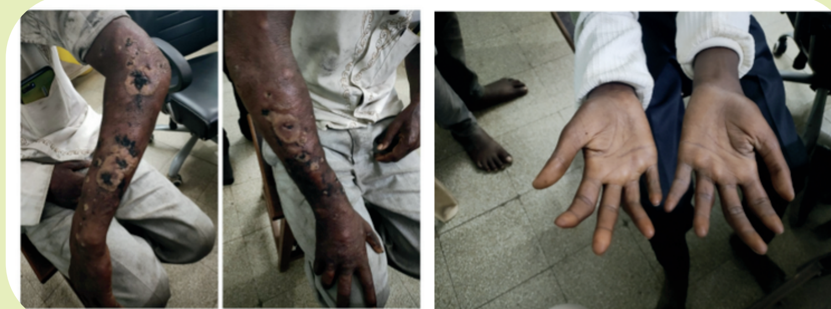
Extensive Undiagnosed Lepromatous Leprosy