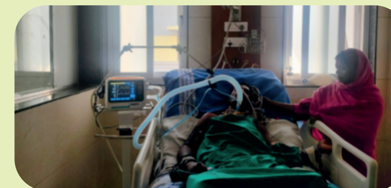
Patient with Tetanus on the Ventilator

Over the past 10 years, 11 Tetanus patients were treated, with one death. Most (10 of 11) required ventilatory support, with an average hospital stay of five weeks. Cases included 4 children aged 10-15, highlighting suboptimal childhood vaccine coverage.