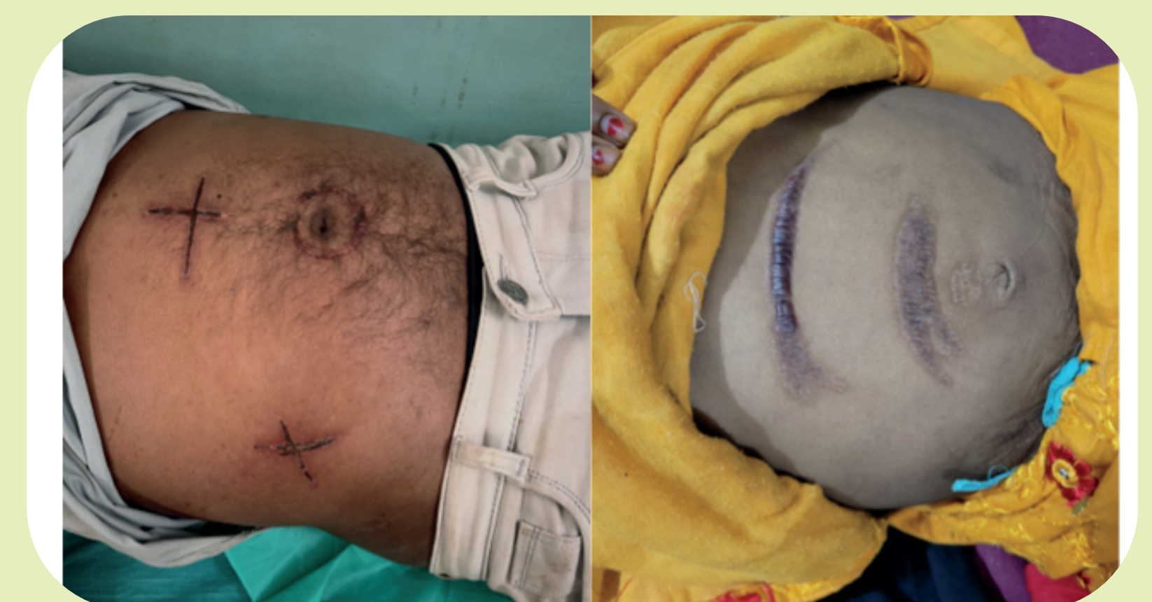
Branding in a patient with DU Perforation