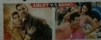
AIRLIFT V/S KKHHS