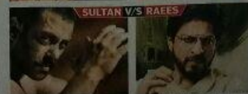
SULTAN V/S RAEES